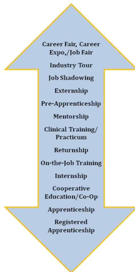
FIGURE 1: Types of Working Learning Programs